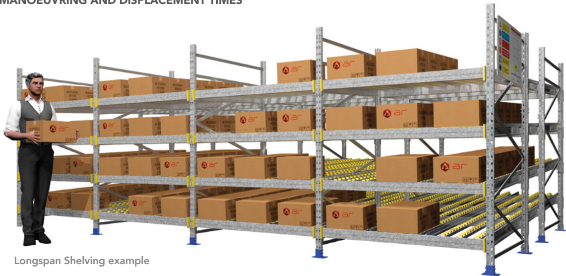
Longspan Shelving example