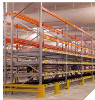
APR (Adjustable Pallets Racking)